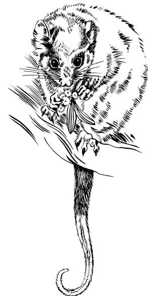
Common Ringtail Possum

The Dandenong Ranges National park was proclaimed in December 1987. It consists of the amalgamation of Fern Tree Gully National Park, Sherbrooke Forest and Doongalla Estate along with the Upwey and Sassafras land corridors. In 1997, the Olinda State forest was formally added to the National Park along with the Montrose Reserve.